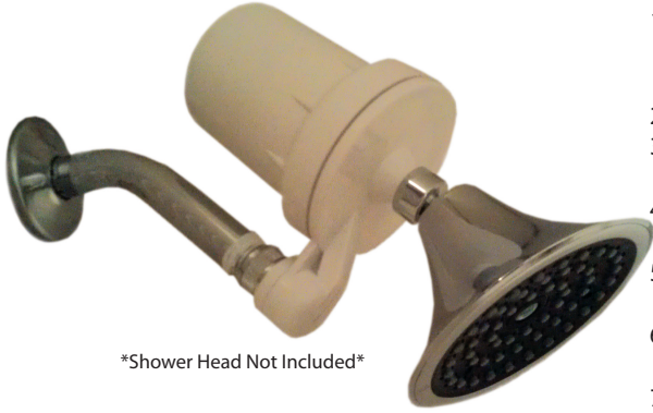
*Shower Head Not Included*